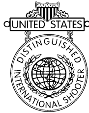
United States International Distinguished Shooter Badge