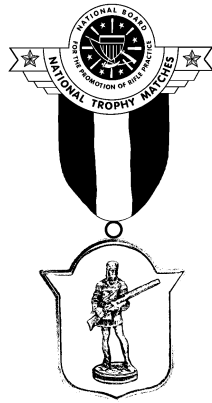
Daniel Boone Trophy Medal