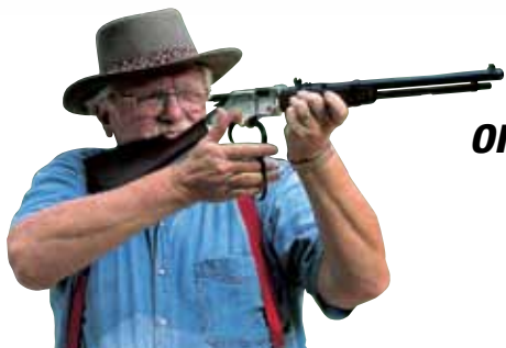
Henry Acu-Bolt .22 LR / .22 Magnum / .17 HMR

Calling all couch potatoes. Drop the remote and get out to the range for a great day of shooting fun. Shooting enthusiasts across America are buying Henrys because they are magnificently styled, have the smoothest actions, perform with flawless reliability, bear the great historical name of Henry and are affordably priced.