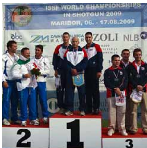
Men's Double Trap Team