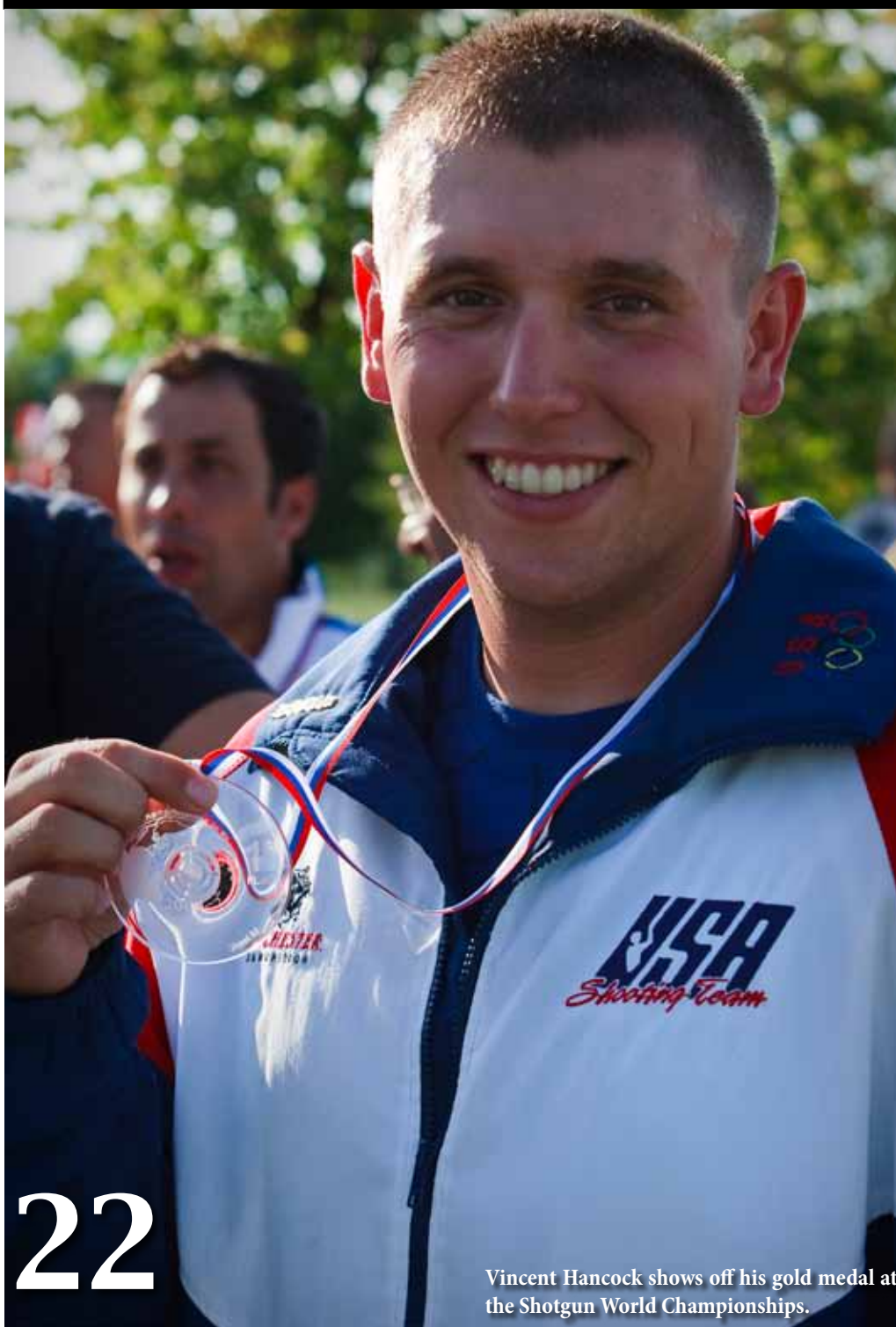
Vincent Hancock shows off his gold medal at the Shotgun World Championships.