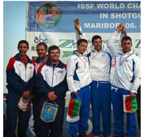
Junior Men's Trap Team