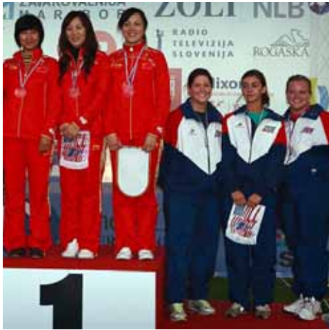
Junior Women's Trap Team