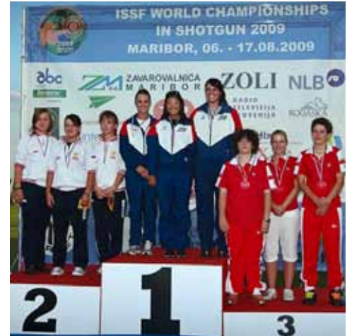
Junior Women's Skeet Team