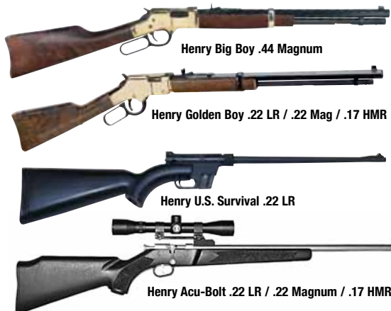
Henry Big Boy .44 Magnum