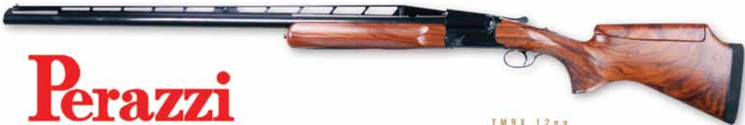
TM9X 12 ga

We are proud to announce the introduction of a new model gun for 2009, the TM9. There will be two versions available of this new, single-barrel gun. One version, the TM9, will have a fixed, ramped rib and a fixed comb stock. The second version, the TM9X, will have an adjustable rib and an adjustable comb stock.