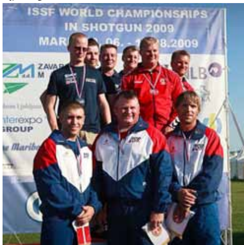
Men's Skeet Team