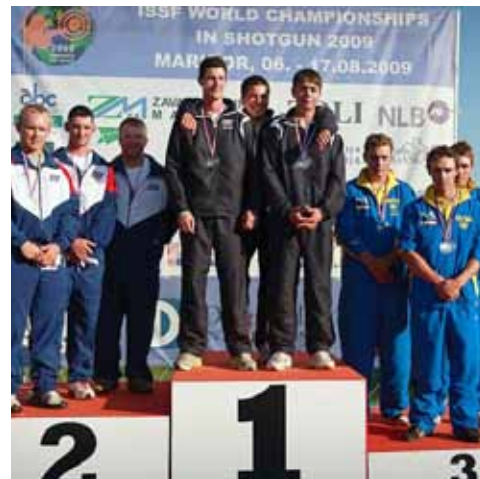
Junior Men's Skeet Team

"Hancock's golden performance occurred exactly one year to the day after he won the Olympic gold in Beijing."